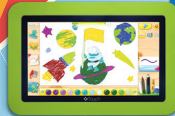
Genee Play Screen 42"

The Genee Early Years Play Screen Range is a great addition to any Preschoolers right up to the end of Key Stage 1 and 2 classroom with objectives of engaging students using educational gaming software to inspire learning.