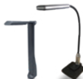
Genee Vision Wireless Visualisers